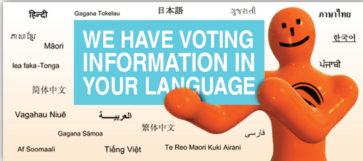
Campaign of the national election authority for the national election in New Zealand, 2014

In one of the states, migrants are only allowed to run for office and vote in school board elections (USA) while in four other states, migrants are allowed to cast a ballot in national parliamentary elections (New Zealand, Malawi, Uruguay, and Chile). In New Zealand a one-year residency is required, in Chile 5 years, in Malawi 7 years, and in Uruguay 15 years.