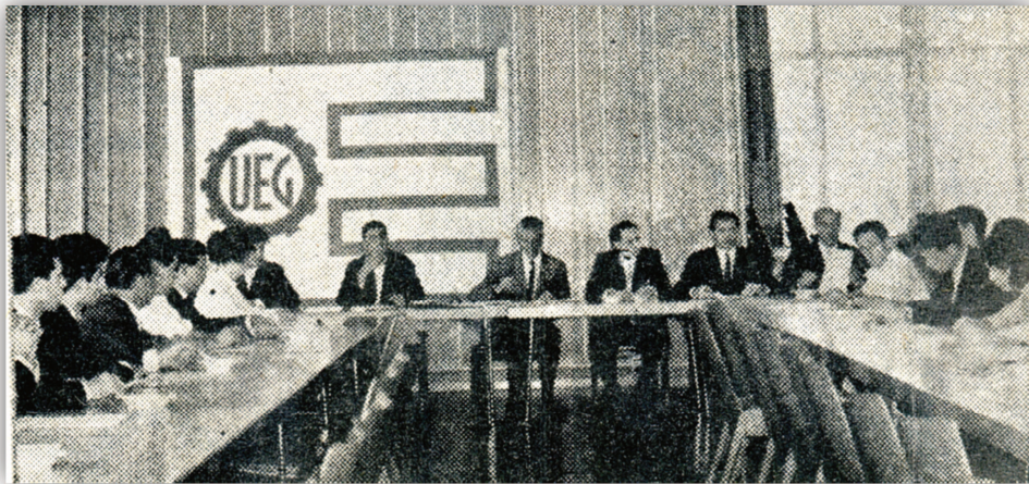
parliament“ in 1964 which first convened on May 2, 1964.

Whoever lives in a community is affected by political decisions—independent of nationality. The participation in elections by all foreign citizens promotes integration and is an expression of social and political equality.